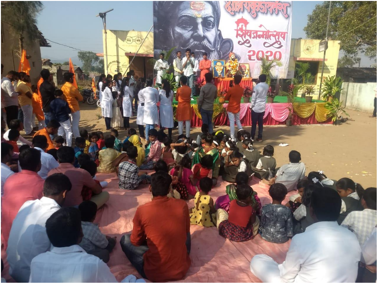
“Shree Shivaji Maharaj” Jayanti Celebration.(19 Feb 2020)