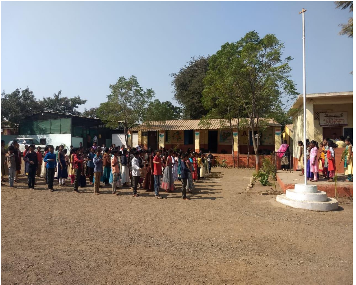
Village School Students Activity By NSS Volunteers.