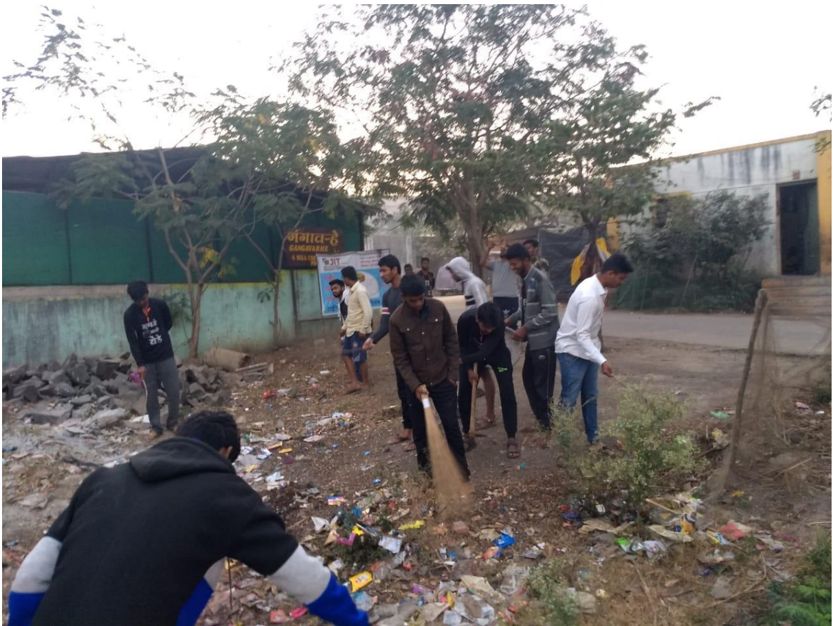
“Cleanliness Drive” By Volunteers.