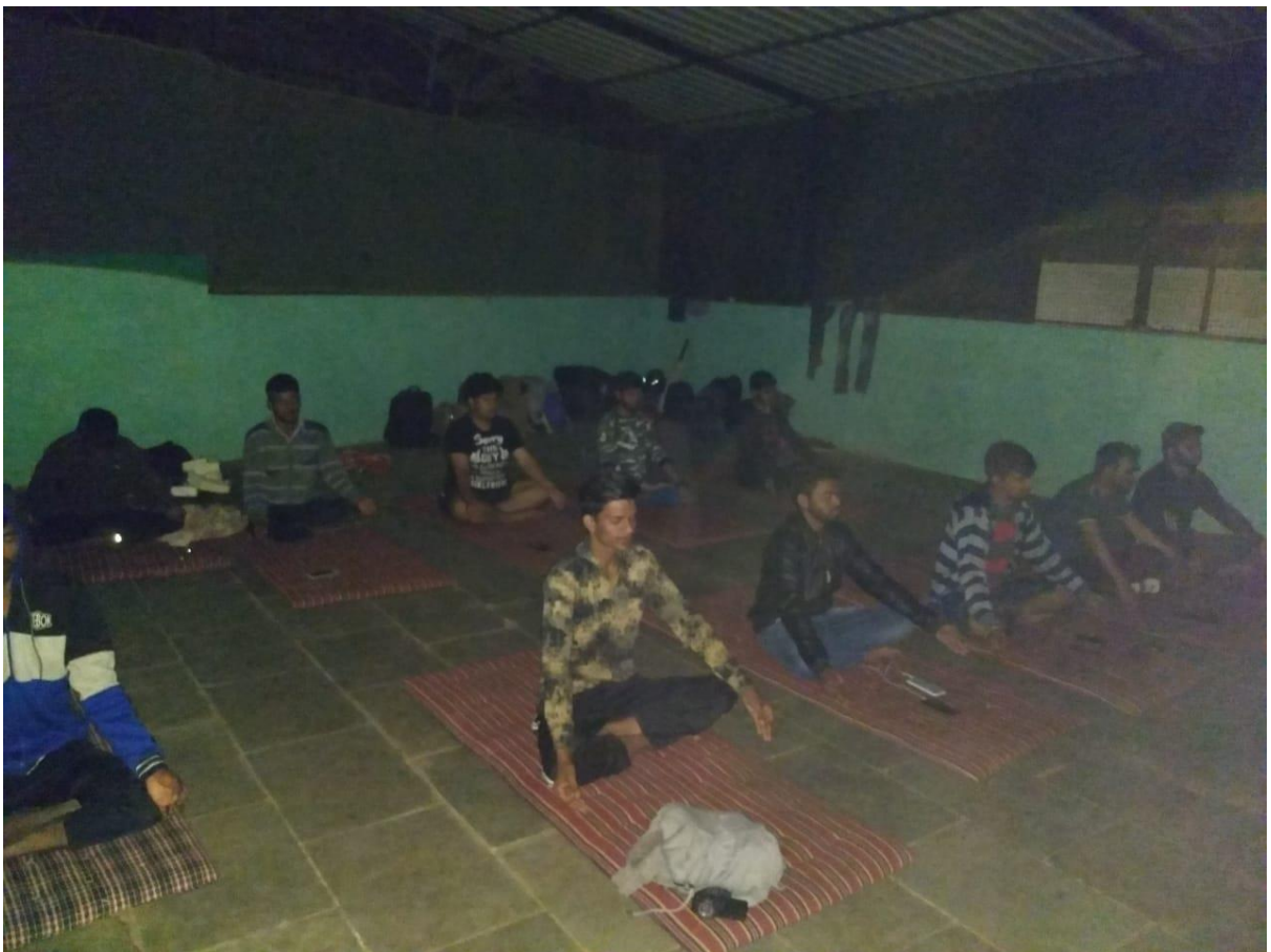
NSS Volunteers Doing Yoga Sessions Early Morning.